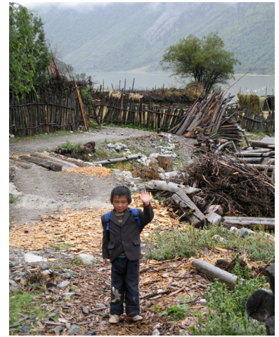
A village boy takes time to wave.

The earthquakes this past May were devastating to thousands and thousands of Chinese, but have opened many doors that will allow us to reach into their lives and spread the Gospel. We soon will begin to learn more details of these opportunities as our American contacts have just recently returned to China. We anticipate that many schools and churches will need to be rebuilt as well as orphanages and medical clinics. These are powerful ways to share God's love for his children.