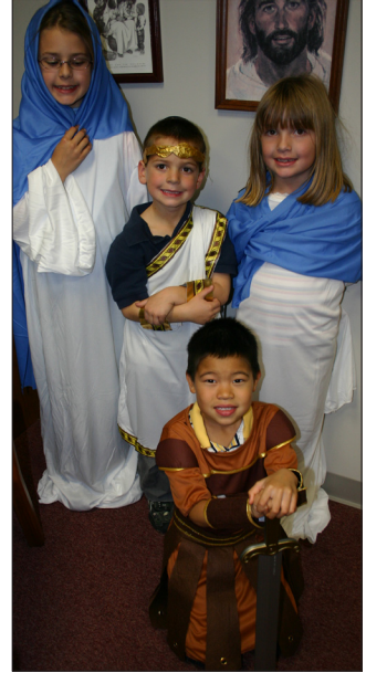
The children are preparing for this year's Christmas program.

What's so different? Aside from traveling from site to site, this year we will have all ages involved in the same Christmas program. We will have more than 150 ministry partners involved in this year's program. In addition, this year's program has been written by the ministry staff.