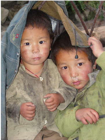
Local Children take cover from the rain.

Late last spring, I was on my way to church and as I drove I was thinking about mission work and why it often seemed like something very important, but was